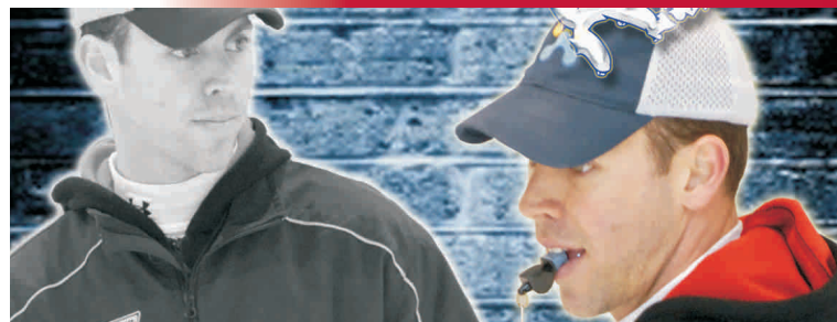
Head Instructor: Jarret Reid Memorial Cup Champion and Professionally-Certified instructor